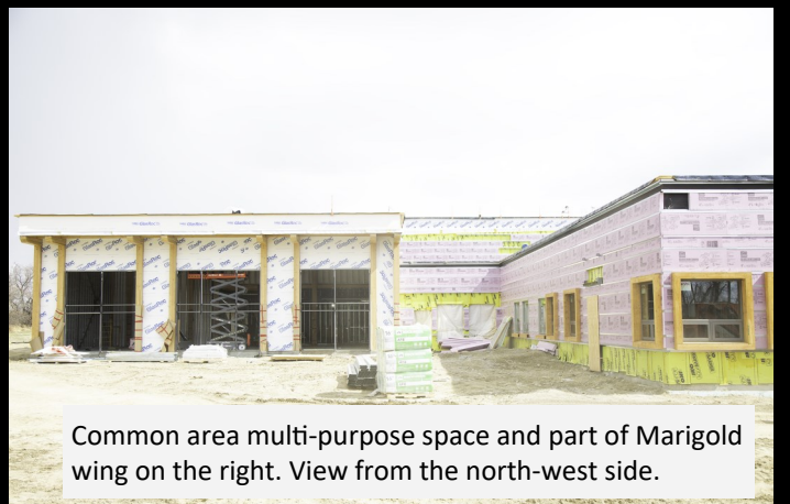
Common area multi-purpose space and part of Marigold wing on the right. View from the north-west side.