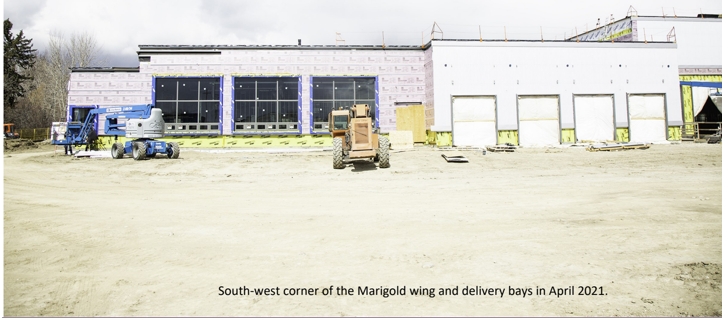
South-west corner of the Marigold wing and delivery bays in April 2021.

PROJECT HISTORY: Background information and details on past progress, as well as previous issues of this publication can be found on the Marigold website at: www.marigold.ab.ca/projects-events/new-headquarters-building/the-project