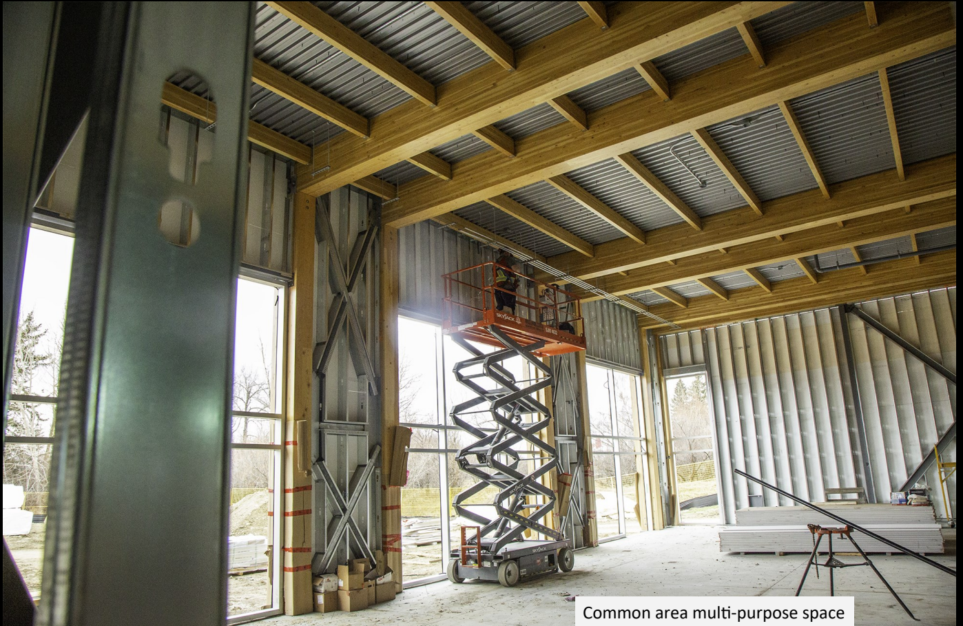
Common area multi-purpose space