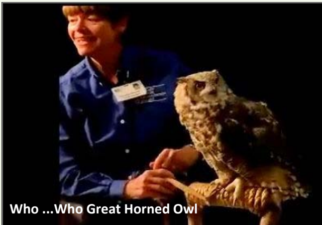
Who ...Who Great Horned Owl

Speak to local library staff to see if the RISE Network can save your organization time and money.